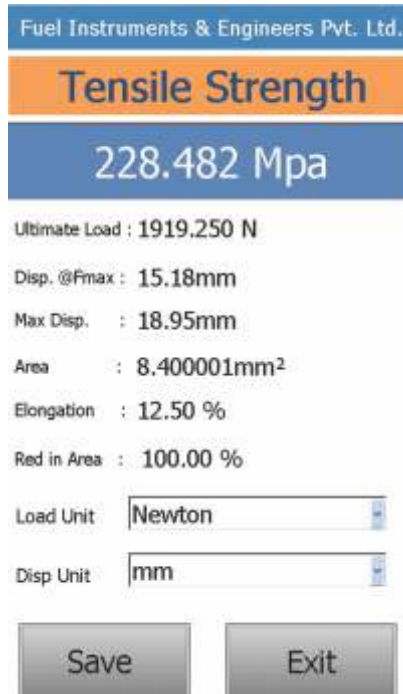
Test Result Display