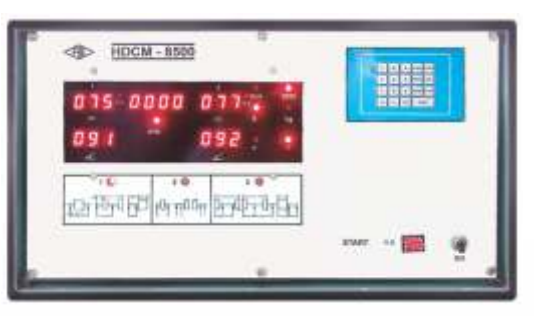
HDCM 8500 Panel

Machine provided with Optional Vertical Drilling Attachment.